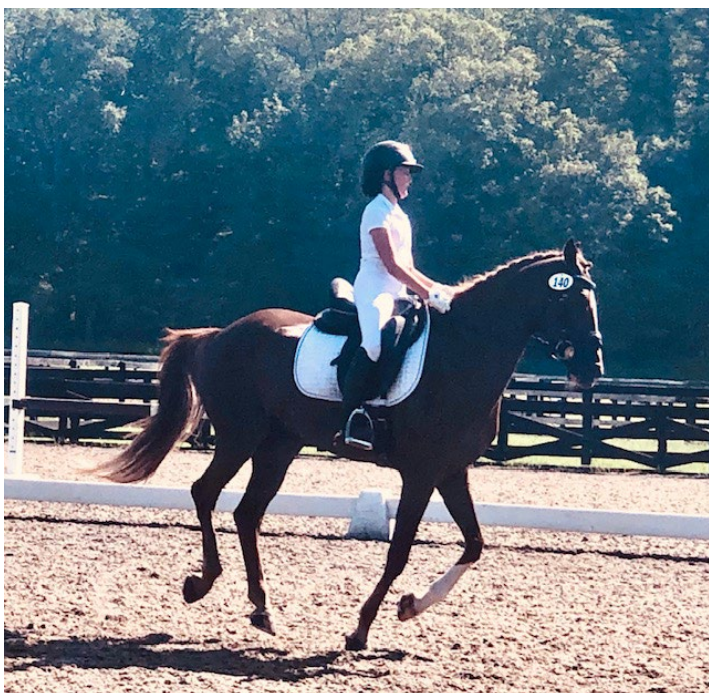
CDA Member & Youth Competitor