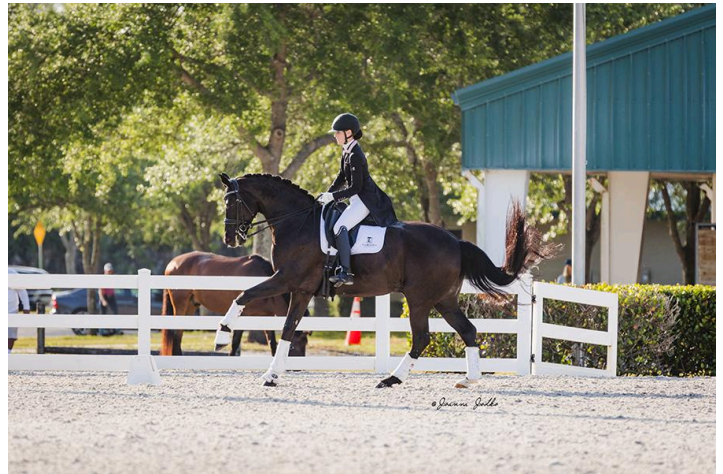
Furst Fritz owned by Misty Meadows Equestrian, LLC

environment that blends structure with enthusiasm. We incorporate thoughtful cross-training, provide safe and interesting school horses, and maintain a positive, supportive culture. My goal is to show young riders that the foundations themselves can be exciting and that the partnership you can build with your horse through dressage is so rewarding!