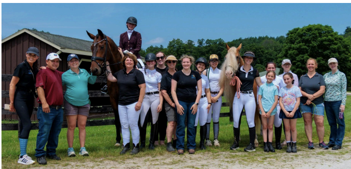
Connecticut Dressage Academy at a CDA show.

She has been such a joy to develop. I am taking my time with her foundation and focusing carefully on strength, balance, and confidence. She is exceptionally kind, with a wonderful mind and presence. The plan for 2026 is to debut at Third Level and continue building her correctly for the future. More than anything, I am enjoying the daily process with her - she is truly special.